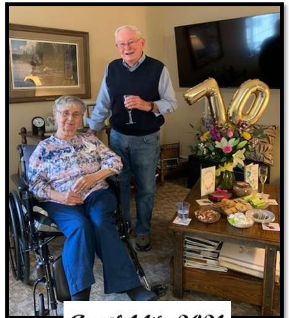
April 14 th , 2021