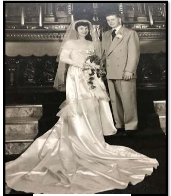
April 14 th , 1951